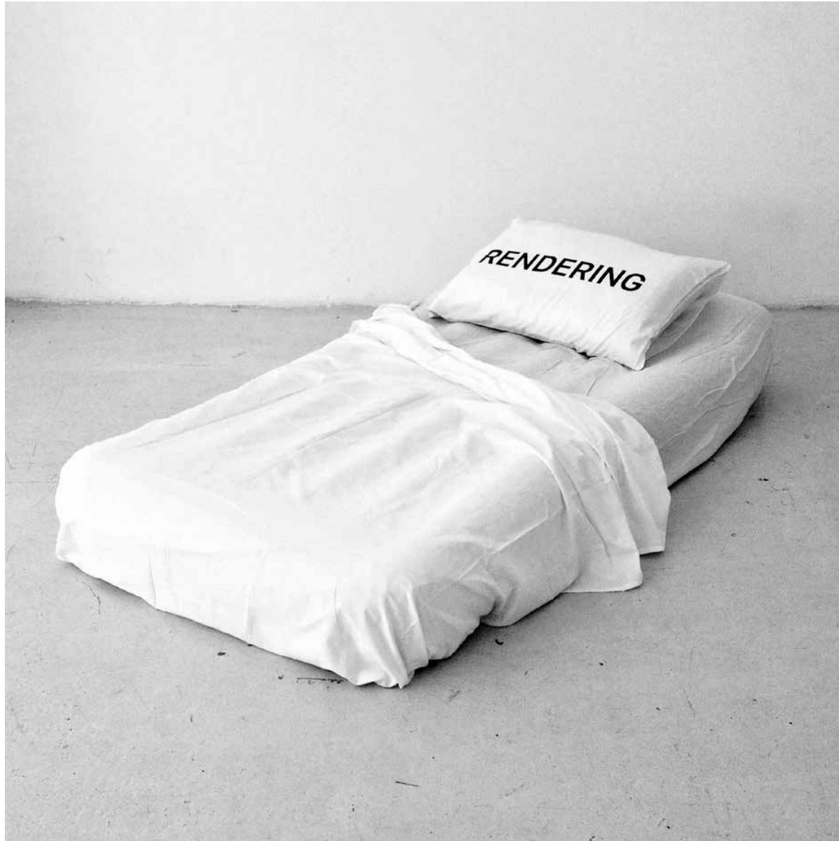
Rick Silva, "Rendering," 2015.

sun and the Earth's rotation regulate biological rhythms is too low, as they follow a steady cycle and vary only over large geographical areas. Or worse, they regulate rhythms in a disorganized way, with weather, trees, mountains, billboards, and light pollution disrupting sleep cycles. Optimizing productivity to capitalism's demands requires more than this—in the melanopic age, biological clock